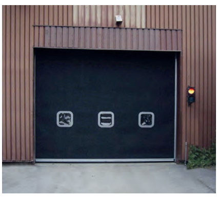
Solid rubber high-speed door with vision field

Styrene butadiene rubber with reinforced polyester woven inlay