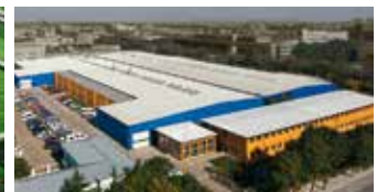
Hörmann Beijing, China