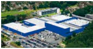
Hörmann KG Amshausen, Germany