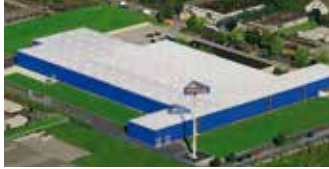
Hörmann KG Dissen, Germany