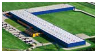
Hörmann Legnica Sp. z o.o., Poland