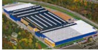
Hörmann KG Eckelhausen, Germany