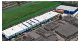
Hörmann Alkmaar B.V., Netherlands