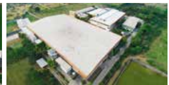
Shakti Hörmann Ltd., India

Hörmann is the only manufacturer worldwide that offers you a complete range of all major building products from one source. We manufacture in highly-specialised factories using the latest production technologies. The close-meshed network of sales and service companies throughout Europe, and activities in the USA and Asia, make Hörmann your strong partner for first-class building products, offering "Quality without Compromise".