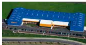
Hörmann Flexon LLC, Burgettstown PA, USA