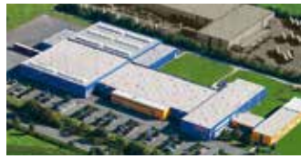
Hörmann KG Antriebstechnik, Germany