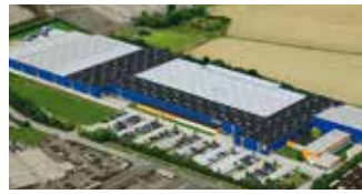
Hörmann KG Brandis, Germany