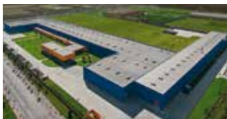
Hörmann Tianjin, China