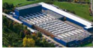
Hörmann KG Freisen, Germany