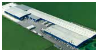
Hörmann LLC, Montgomery IL, USA