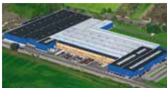
Hörmann KG Werne, Germany