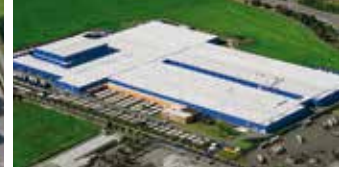
Hörmann KG Ichttershausen, Germany