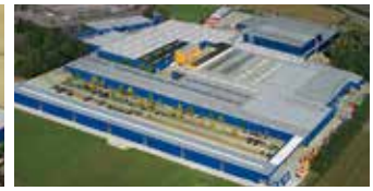
Hörmann KG Brockhagen, Germany