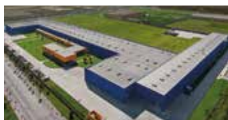
Hörmann Tianjin, China