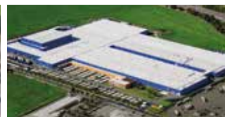
Hörmann KG Ichttershausen, Germany