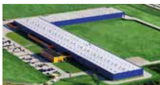
Hörmann Legnica Sp. z o.o., Poland