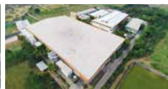
Shakti Hörmann Pvt. Ltd., India

Hörmann is the only manufacturer worldwide that offers you a complete range of all major building products from one source. We manufacture in highly-specialised factories using the latest production technologies. The close-meshed network of sales and service companies throughout Europe, and activities in the USA and Asia, make Hörmann your strong partner for first-class building products, offering “Quality without Compromise”.