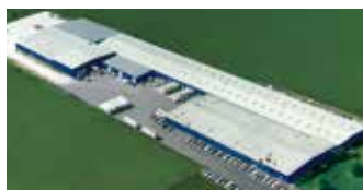
Hörmann LLC, Montgomery IL, USA