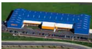
Hörmann Flexon LLC, Burgettstown PA, USA