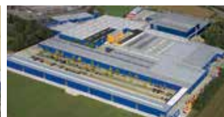
Hörmann KG Brockhagen, Germany