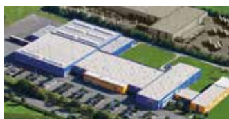
Hörmann KG Antriebstechnik, Germany