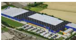
Hörmann KG Brandis, Germany