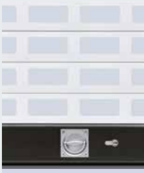
Lockable bottom profile