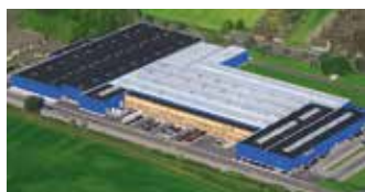
Hörmann KG Werne, Germany