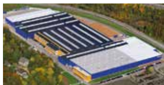
Hörmann KG Eckelhausen, Germany