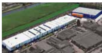
Hörmann Alkmaar B.V., Netherlands