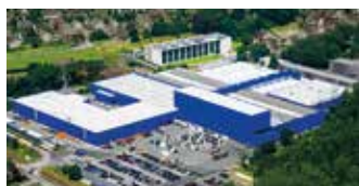
Hörmann KG Amshausen, Germany