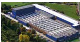
Hörmann KG Freisen, Germany