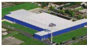
Hörmann KG Dissen, Germany