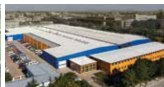
Hörmann Beijing, China