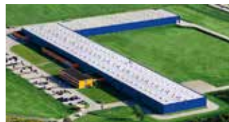
Hörmann Legnica Sp. z o.o., Poland