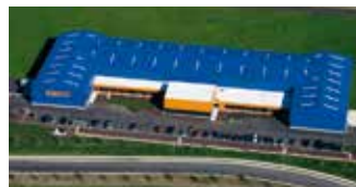
Hörmann Flexon LLC, Burgettstown PA, USA