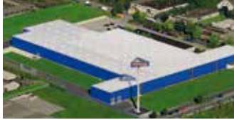
Hörmann KG Dissen, Germany