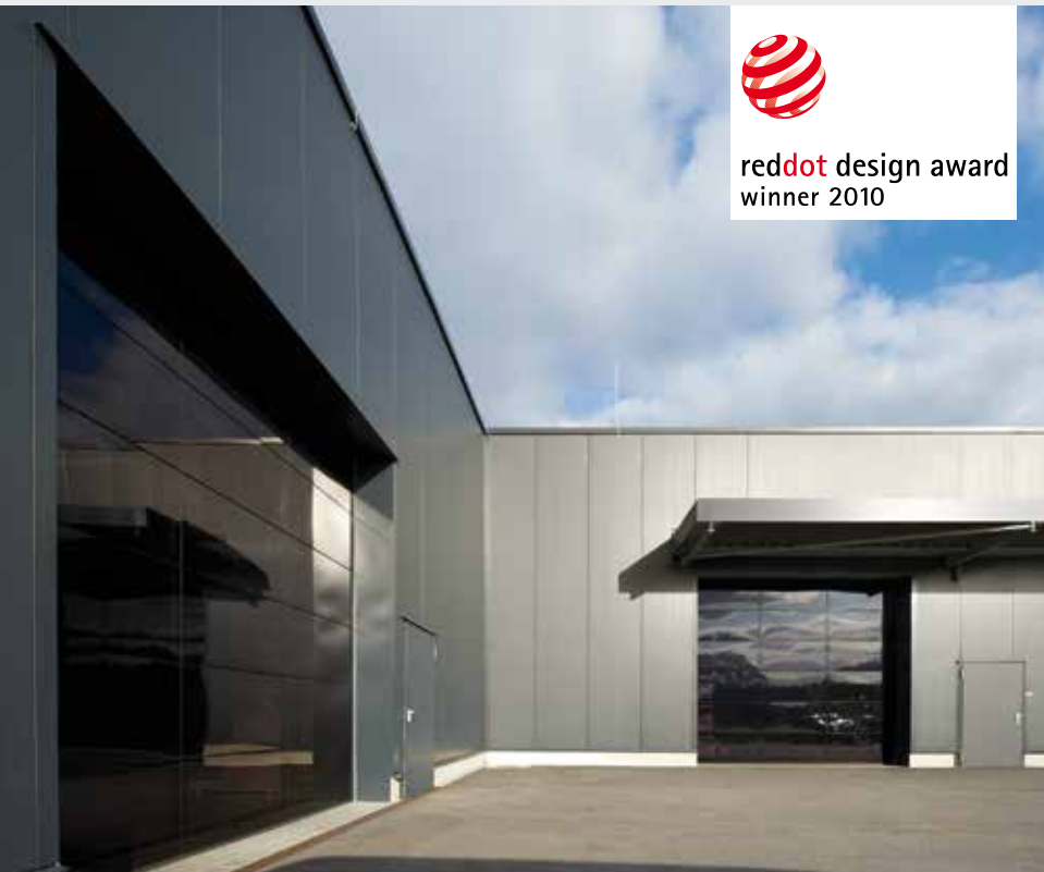
Industrial Sectional Door