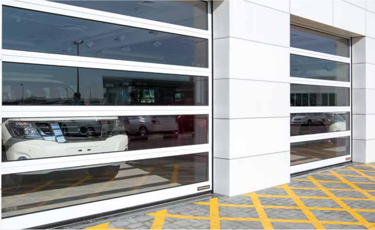
Industrial Sectional Door

Benefit from our experience and strong performance