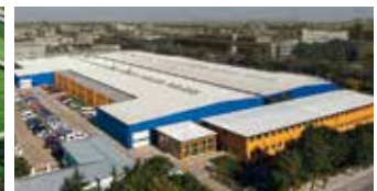
Hörmann Beijing, China