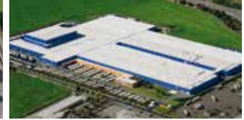
Hörmann KG Ichttershausen, Germany