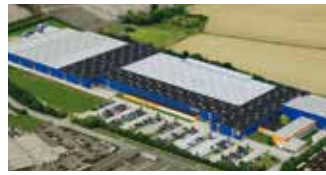
Hörmann KG Brandis, Germany