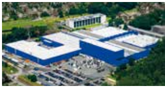
Hörmann KG Amshausen, Germany