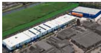
Hörmann Alkmaar B.V., Netherlands