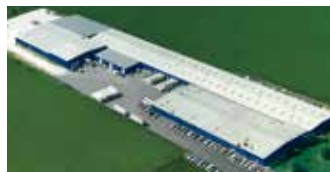
Hörmann LLC, Montgomery IL, USA