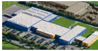
Hörmann KG Antriebstechnik, Germany