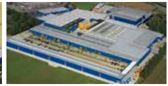
Hörmann KG Brockhagen, Germany