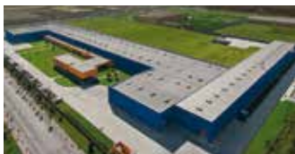
Hörmann Tianjin, China