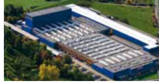
Hörmann KG Freisen, Germany