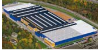
Hörmann KG Eckelhausen, Germany