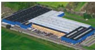
Hörmann KG Werne, Germany